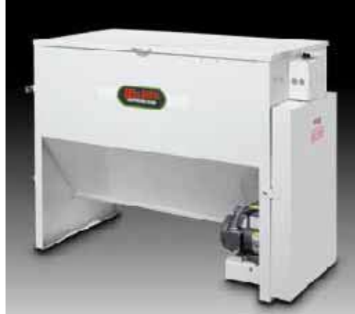
500 lb. Double Nutrient Blender